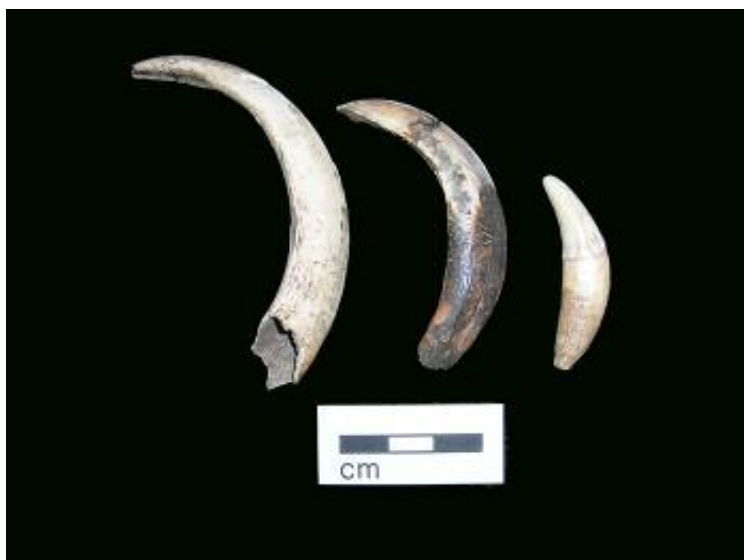
Figure 1: Canines of male pig, female pig and dog. The male pig have triangular open ends as they continue to grow where as the female canine is closed.