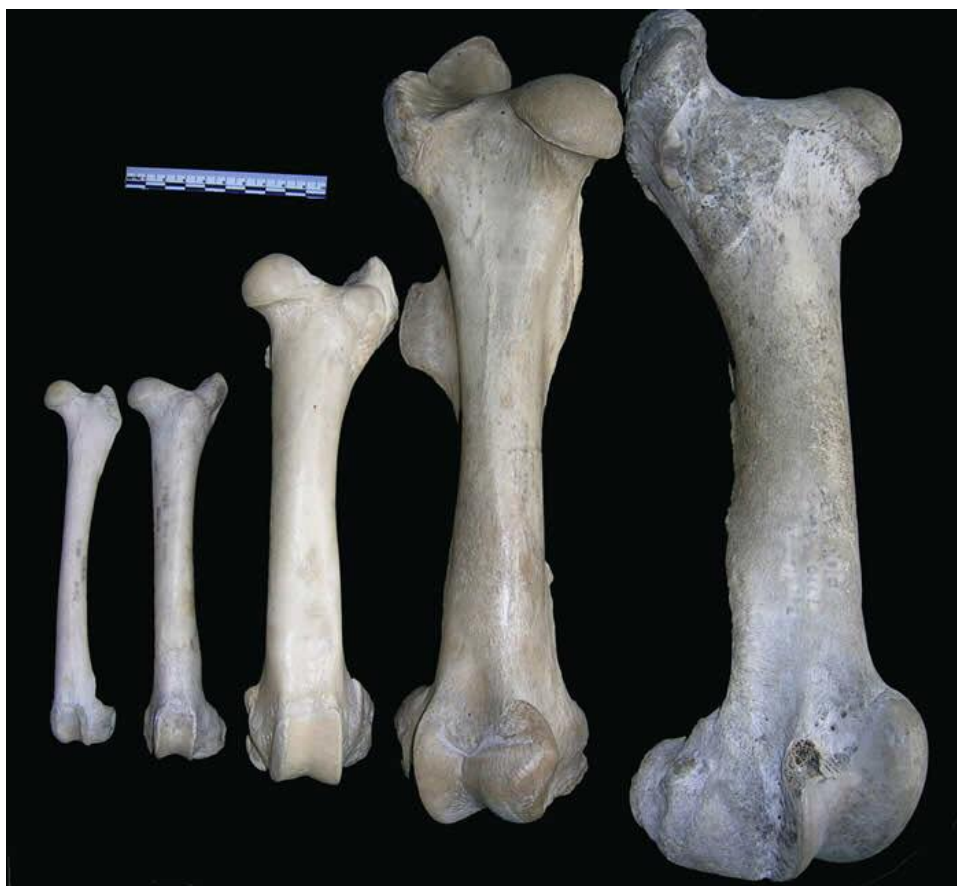
Figure 4: Femur of dog, sheep, pig, horse and cow

Mammals: Size is usually a good indication of the type of mammal, which are generally divided into three main categories; large (horse/cow size), medium (sheep/goat/pig/dog) and small (rodent). Figure 4 illustrates the size variation of the different mammals whilst figure 5 demonstrates the morphological difference between the femoral head of a horse and a cow.