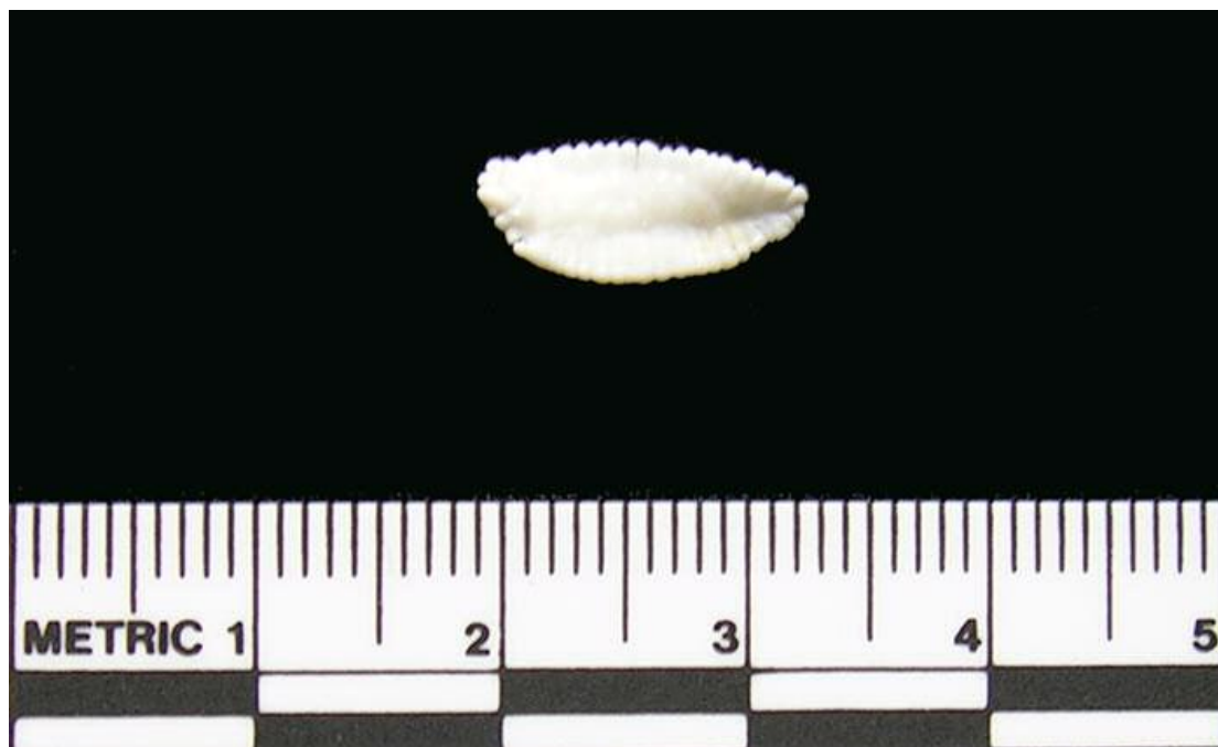
Figure 3: Otolith of cod

It may be possible to extract additional information from animal bones. For example, butchery methods can be assessed from chop and cut marks on the bones as well as evidence of scavenging (Binford 1981). On most archaeological sites, the information extracted may at least provide a ratio of the different species present and which parts of the animals are present. This may help identify the type of site. By identifying the different elements present it may be possible to establish whether the site was used primarily for butchery or whether the butchered remains were deposited there subsequent to cooking and consumption of meat. Sometimes one type of element may be present in abundance, such as at Walmgate in York where pits were found with large amounts of sheep metapodials. These were waste from the industrial process of tanning, undertaken during the post medieval period of the site and provided crucial information on the processes and methods in the tanning industry (O'Connor 1984)