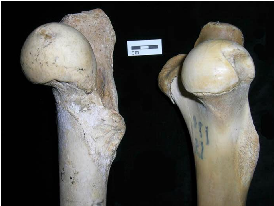
Figure 5: Femoral head of cow and horse, note the V-shaped in the horse which is not present in cow.

To the untrained eye infant human remains are sometimes mistaken for animal remains, as they are occasionally recovered from domestic features such as postholes and under floor layers (Scott 1999 p.4).