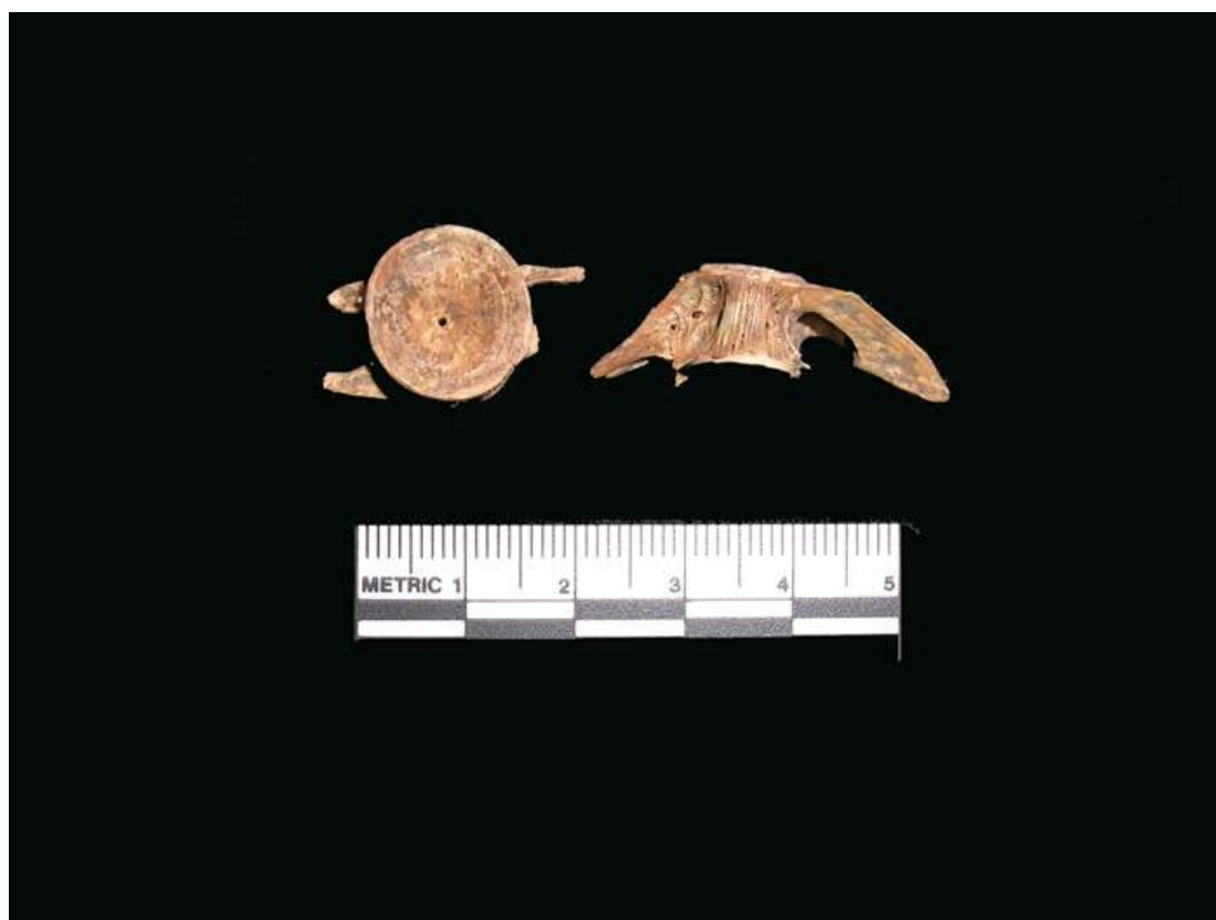
Figure 10: Fish Vertebrae

Fish again are different and look different. Naturally they do not have long bones such as mammals and birds. Their bones also allow for continuous growth. The bones have an appearance of layers of thin sheets often translucent to look at. The ribs are very fine and the vertebrae look as if made up by a series of concentric circles (Figure10). Finally the Otoliths (ear bones) are very important to identify as they provide significant information. These may look like small pieces of chalk or pebbles but by closer investigation they have a bevelled oval appearance with fine ripples along the edges (Figure 3)