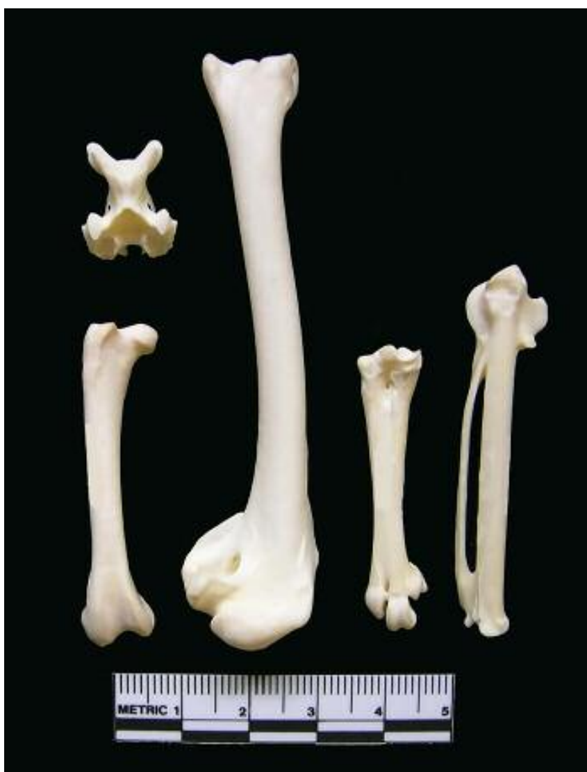
Figure 9: Bird bones (Mallard)