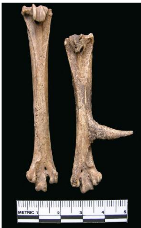
Figure 2: Tarso metatarsus of Female and male bird. The Male has a spur.

Patterns of seasonality may be possible from certain species such as fish, where the otoliths (ear bones) (fig 3) are excellent indicators of seasonal patterns (Davis 1994:81). The shedding of antlers is likewise an indication of season as this happens in a yearly cycle (Rackman 1994)