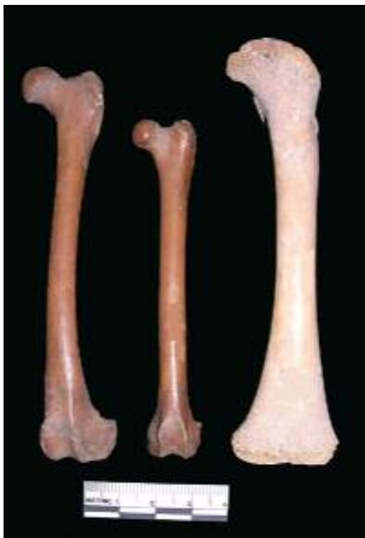
Figure 6 shows a femur from an infant, a dog and a cat. The infant bone is unfused, which means that the individual has not yet fully developed and the ends are not yet fused onto the main bone shaft. The appearance of the ends in such cases are billowed (like ripples in sand), where as the other bones are fully fused and have smooth ends.

To the untrained eye infant human remains are sometimes mistaken for animal remains, as they are occasionally recovered from domestic features such as postholes and under floor layers (Scott 1999 p.4).