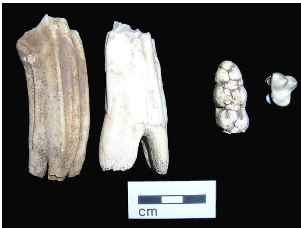
Figure 7: Molar teeth of horse, cow, pig and dog

Teeth of mammals are frequently found as they survive particularly well. Figure 7 shows examples of molars of Horse, cow, sheep/goat, pig and dog whilst Figure 1 show the canines of a pig and a dog. Canines are very small in horse and cow and are often absent.